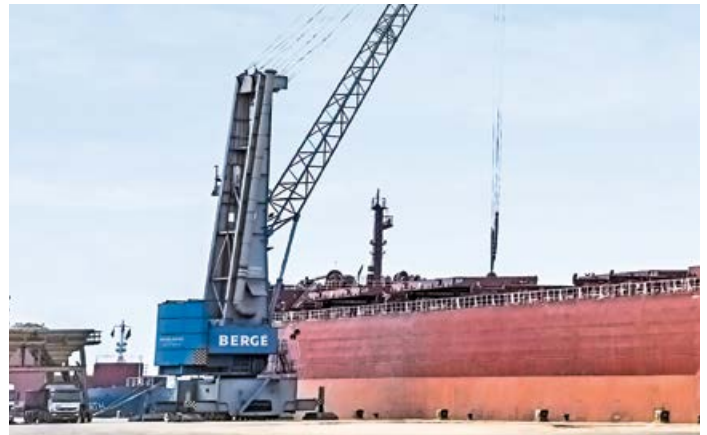
The HMK 330 EG mobile harbor crane in Bergé's terminal in the Port of Málaga: The used crane is handling bulk material and general cargo since spring 2017